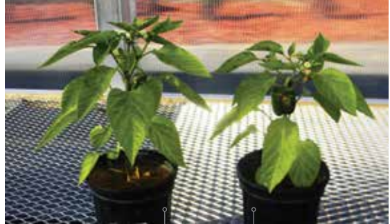
50/50 Potting Soil and Profile® Lawn & Landscape Porous Ceramic Soil Conditioner